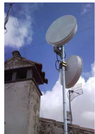
Figure 3. Repeater installation, Spain

With the support of Universidad Politécnica de Madrid (UPM), Albentia Systems has achieved two unique implementation of WiMAX technology one using multiple antennas and another for mesh connectivity. This can be used for repeaters to increase the coverage of WiMax especially where terrain limits line-of-sight operation, and also to gather distributed information in large areas. A pilot WiMAX repeater network has been deployed in the south of Spain, to provide broadband access for real users. The deployment has run for over six months and as N4C ends it continues working. An ad-hoc WiMAX network organizer was introduced, as generic entity for DTN and multi hop strategies. The combination of WiMAX and DTN was tested at the SmartBay test bed in Ireland with results confirming the relevance of DTN for challenged scenarios. Mobile nodes for animals were researched by UPM, with kinetic mechanisms replacing batteries. Real life tests performed with Tannak AB in parallel to their system Herdview were successful. The next step is refining the mechanical design of the kinetic generator.