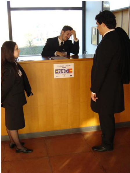
Students in workshop reception.