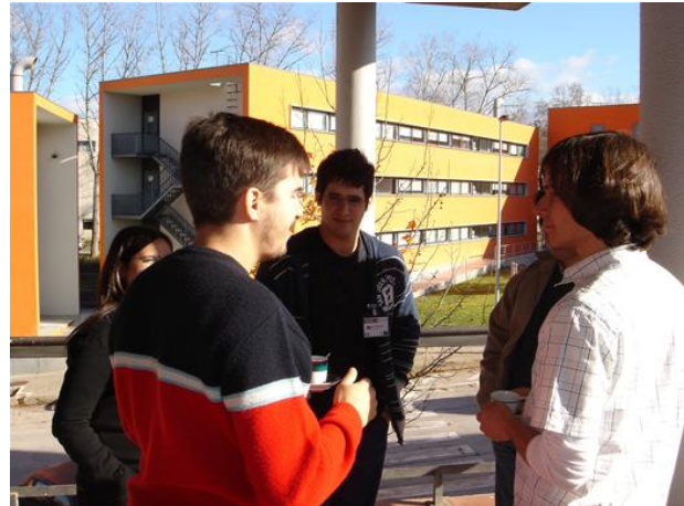
Interaction between students and others participants.