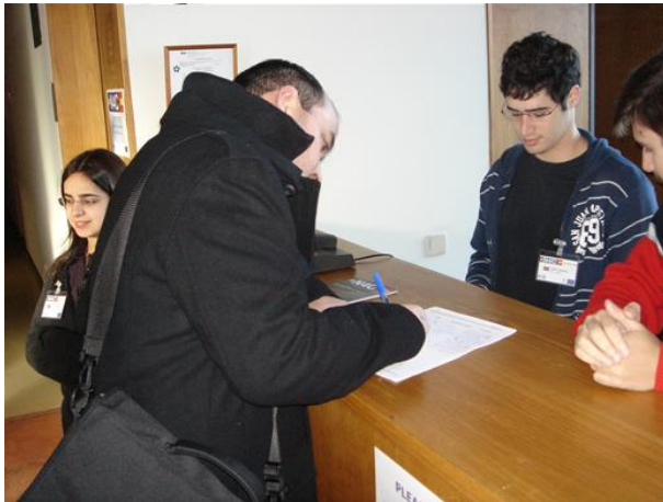
Students helping in participants' registration.