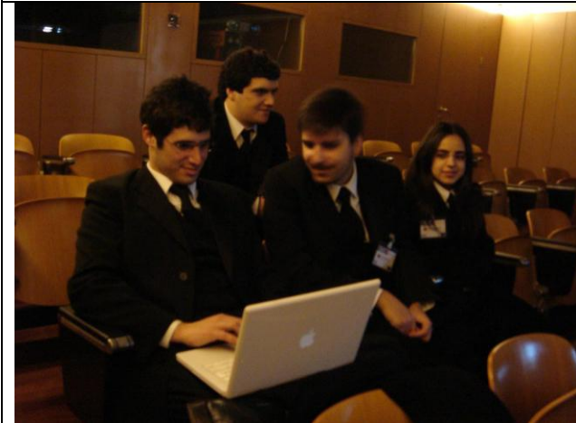
Students in workshop audience.