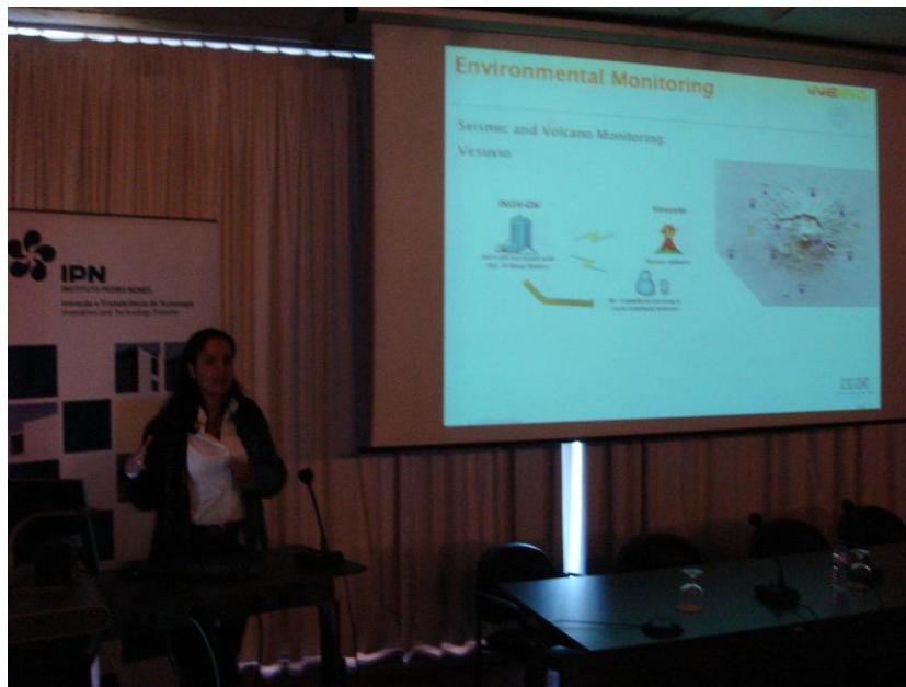
Figure 7 – WEIRD project presentation

The WEIRD project was an European integrated project, that started in June 2006, with 2 years of duration and 17 partners, and had as goal the application of the WiMAX technology to provide internet access to remote areas (facilitate environmental monitoring, telemedicine and fire prevention). Four testbeds were implemented (Portugal, Italy, Romania and Finland) and for each one of them it was developed software models which were compose by: a mobile station with WiMAX connection, the base station with connection to the outside and the Connectivity Service Network with connection to the internet.