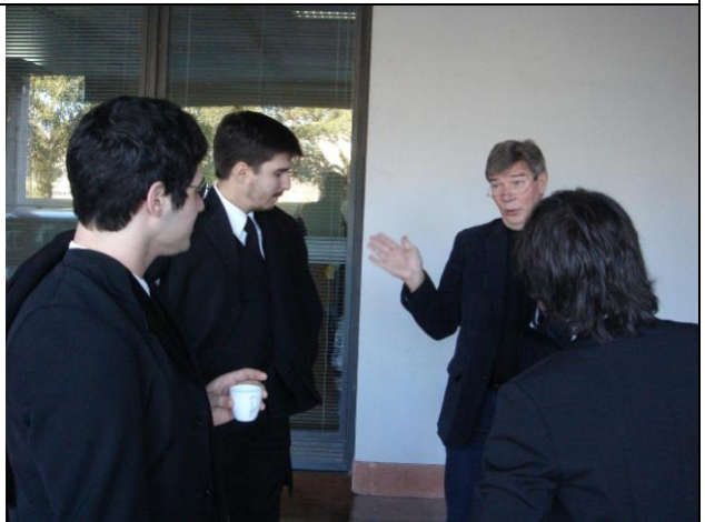
Students and participants at coffee break.