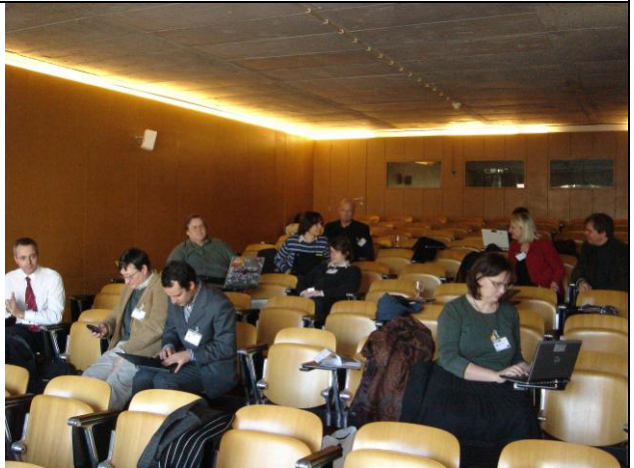
Conference room (presentation recess).