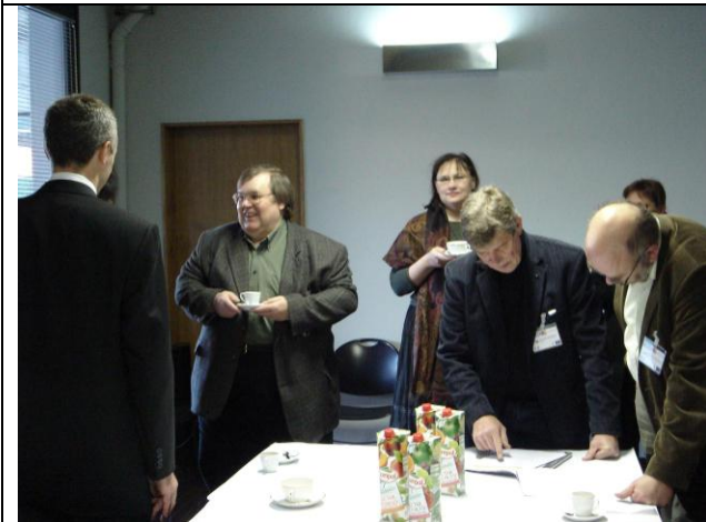
Coffee and tea before the workshop.