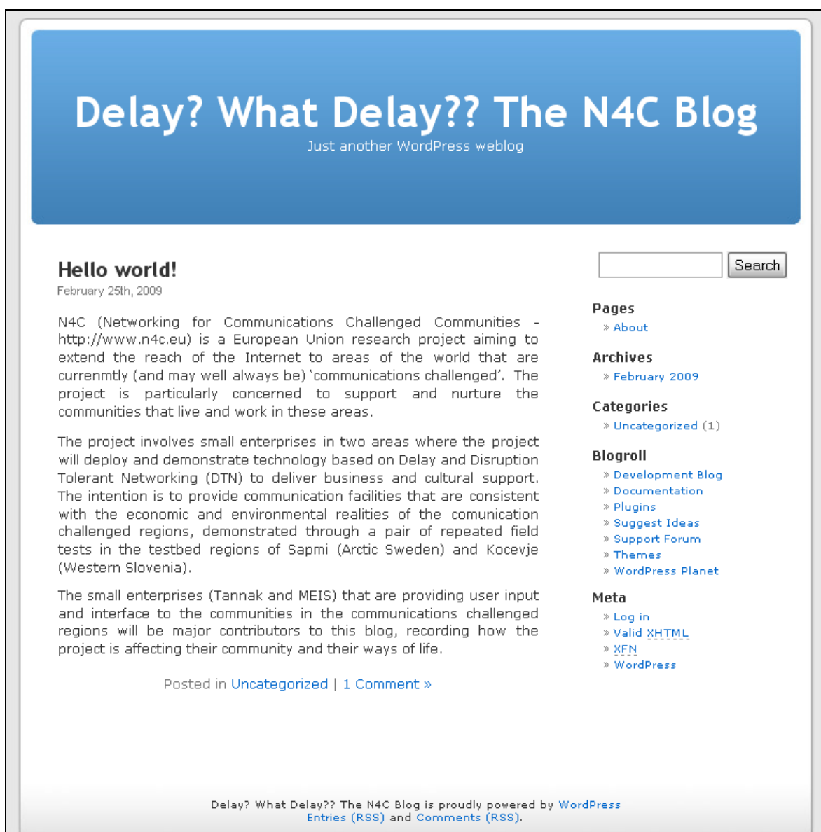
Figure 3 - N4C Blog's appearance

The blog is not fully customized to the CoP, still missing the creation of proposed categories (in section 6.3.2), and then filling it with contents that can arouse interest and foster discussion between the people.