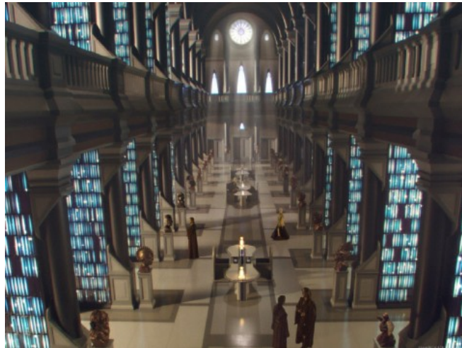
Figure 13. The Jedi Archives. Picture from the George Lucas film Attack of the clones.

For this, a stable temperature is essential. Furthermore, for reading what is said in the books and documents, we need light. The buildings we create to fit the composition of, and end user access to paper sheets and books have through the centuries been served with heating