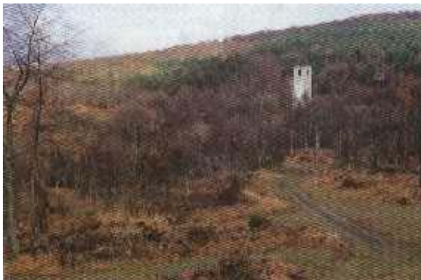
Figures 7 and 8. From the Kočevje region, Slovenia. The village Dolenja Topla Reber 1937 and 1992. http://www.kocevje.si

Kehlmann lets especially Humboldt as a traveller setting out to take measures of the world, struggle with nature and the physical conditions of the planet. Gauss stays at home but in this novel, he too develops his observations of mathematics in a location of not always so pleasant weather (and the reality of the earth as a curved surface, not flat paper). The broad come-back of material interaction to the common understanding of the world and how we gain knowledge within the world, includes accounting for the human organism as location for knowledge production. The typical concentration of gender studies in this stream is, if compared to for instance Kehlmann’s writing, perhaps more situated in establishing loyalty with the excluded , which comes from experiences of women’s exclusion in person from science and technology.