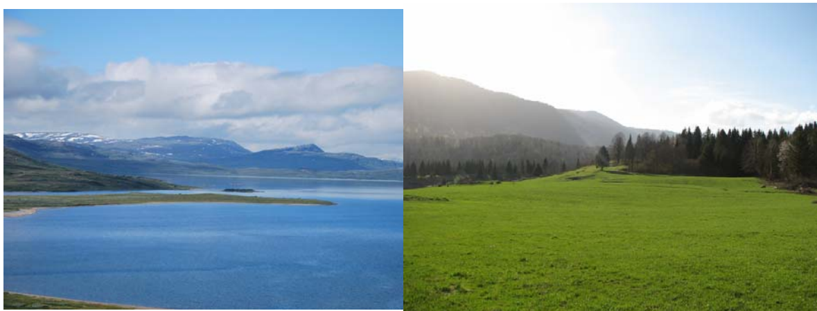
Figure 2 Lapland and Kočevje, landscapes of the test beds.

Both areas are mountainous, rich with forests and wild life and sparsely populated. They represent quite different European climates though, and their political history differs. While Swedish Lapland is the home of an indigenous Sámi population combined with forestry and hydro power production, Kočevje is a formerly closed defence zone of former Yugoslavia, which was first depopulated in connection to the World War Two. The sites are described in N4C Deliverable 8.3 (Udén 2009). Figure 2 shows examples of typical landscape views in the two test areas.